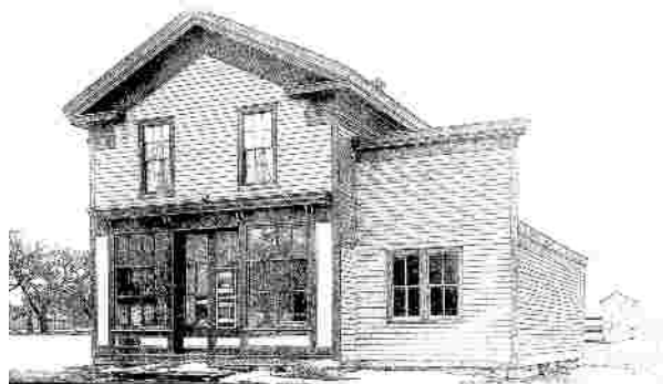
Watrous General Store