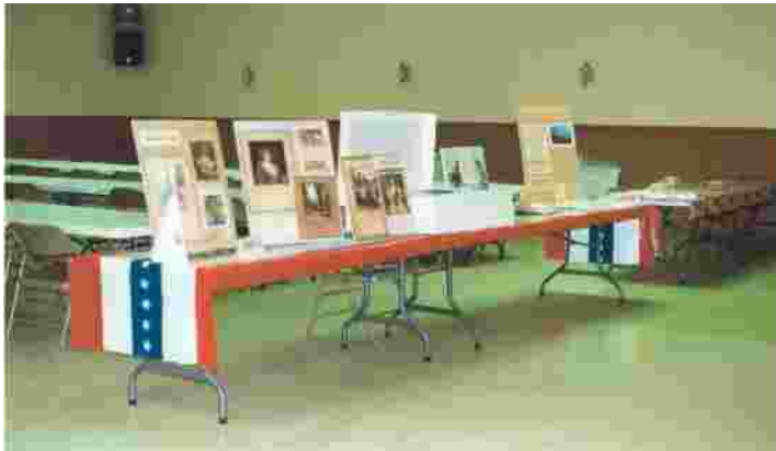
Display of old calendars from the Watrousville/Caro Area Museum