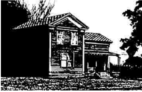
Leonard - McGlone House